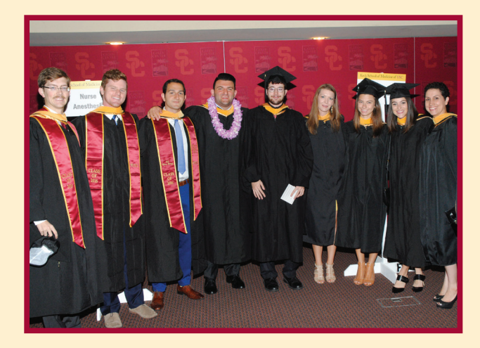
USC's May 2016 Commencement Ceremony marked a beginning, not only for its two-year-old master's program in the nascent field of stem cell biology and regenerative medicine, but also for this program's second graduating class.